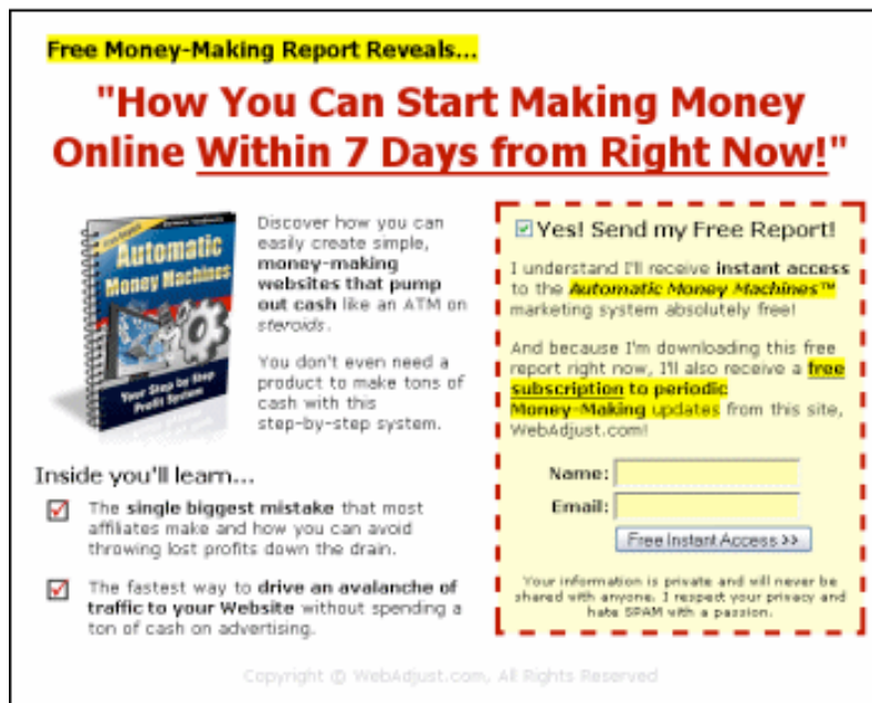
Image: Example Squeeze Page